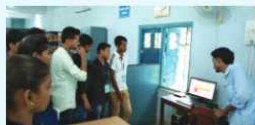
Library Orientation Programme