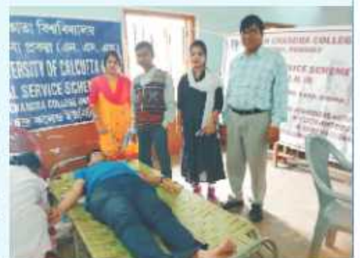
NSS- Blood Donation Programme