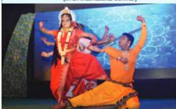
Praak - Saradiya Utsab