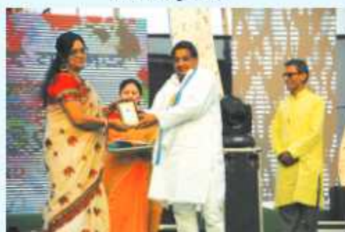
Award given Away by the Hon'ble President