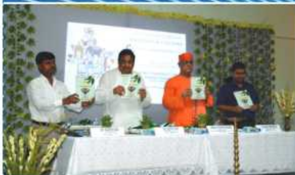
Swami Atmapriyanandaji's keynote address (In an International Seminar)