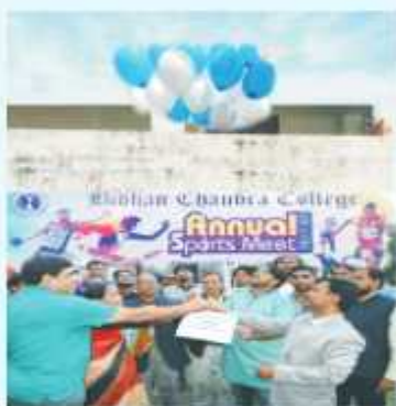
Inauguration of Annual Sports Meet 2019-20