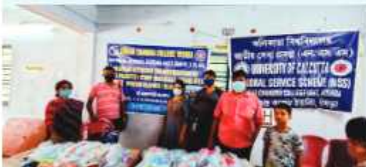
Activities of N.S.S. Units during the Pandemic Period