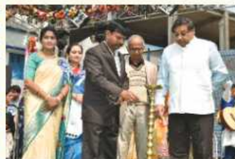
Lighting of the Lamp (Annual Cultural Programme)

Finally, after the successful accreditation of the college by NAAC in 2016, various academic and administrative measures are being adopted in different spheres of the college for its adequate updation. Most significant among those is the year-long celebration of Diamond Jubilee of the college during 2017-18 when quite a good number of outstanding cerebral and cultural events have stolen the show and some more are in the offing.