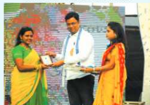
Award given Away by the Hon'ble Member, G.B.