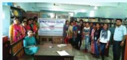
Library reading room service