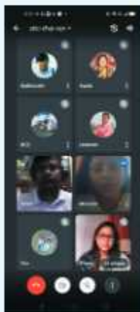
Webinar on Virtual Platform, Dept. of Computer Science