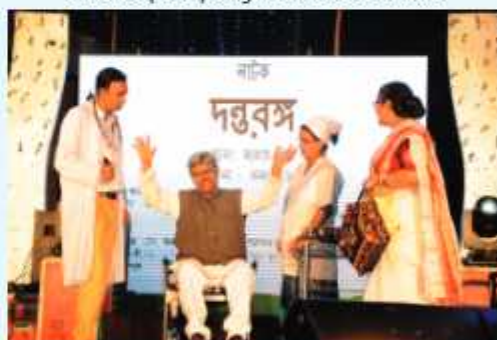
Stage Drama inside the College Campus