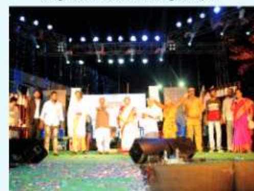
Stage Drama Enacted by Students, Teaching & Non-Teaching Staff