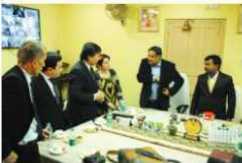
International Seminar (Political Science)