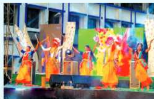
Basanta Utsav, 2020

Besides, Our NSS Volunteers and Programme Officers attended a special camp to Ward No. 8,9 on 18/02/2019 to 25/02/2019. Our NSS students were awarded best NSS Volunteers in the University of Calcutta. Our NSS Programme officers were also rewarded by the University of Calcutta.