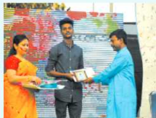
Prize Distribution Ceremony

The College is happy to provide separate Boys' & Girls' Common Rooms with sitting arrangements and Indoor Games facilities.