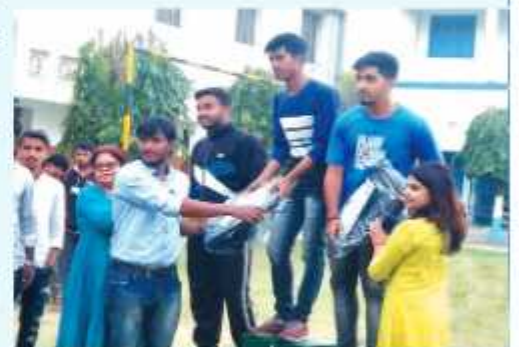
Prize Distribution (Annual Sports)