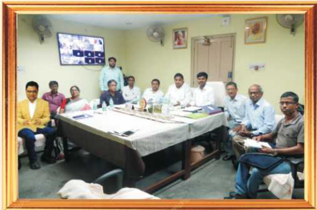
Hon'ble Members of the Governing Body of the college