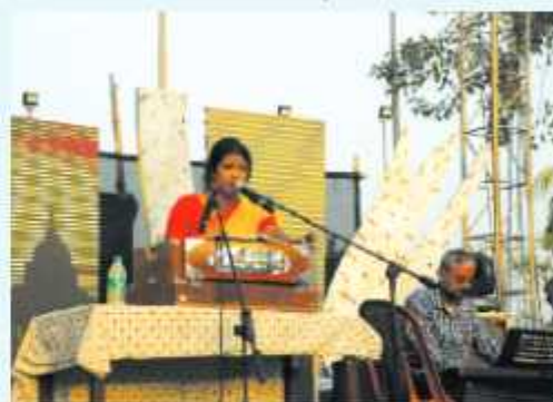
Students participating in Basanta Utsav 2020