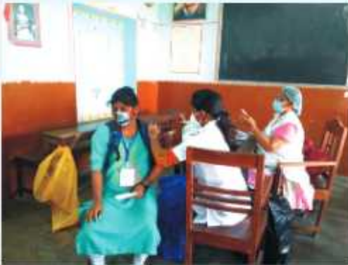
Vaccination Programme (Against Covid-19) for the Students & Staff inside the College Campus