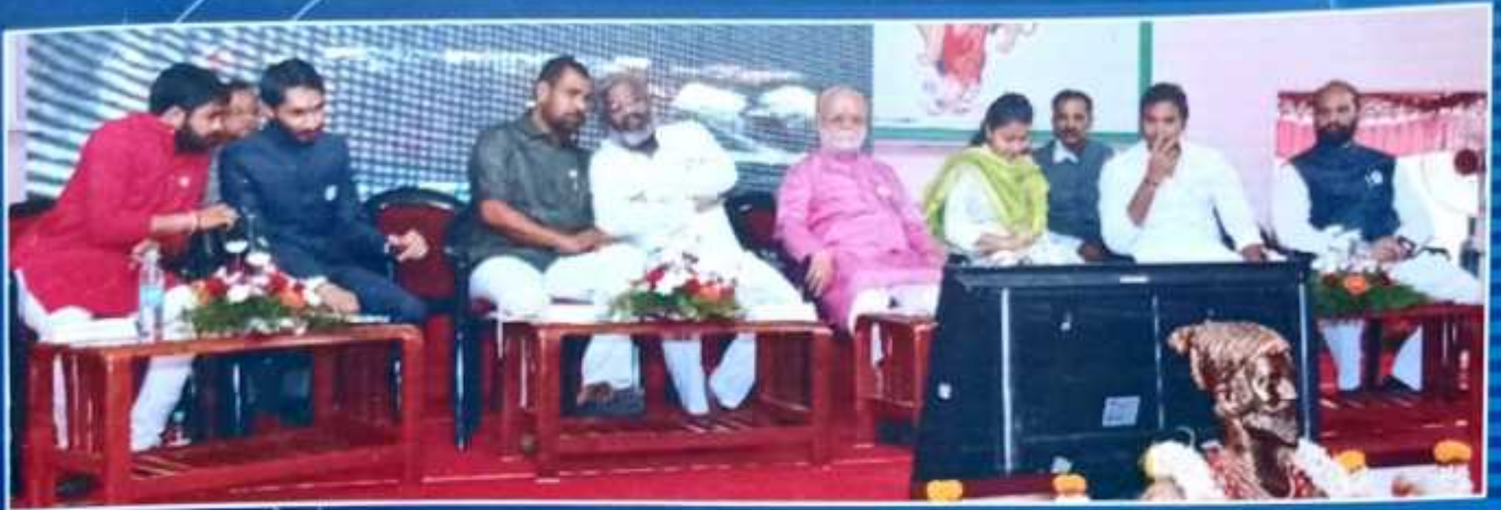
Pune Yuva Sansad Rangmanch