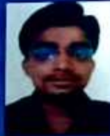
Mahadik Akshay Sanchati Hospital Medical Transcripior CTC - 2.5Lac