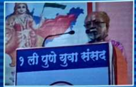
Ex. Minister Shri Ulhasdada Pawar at Pune Yuva Sansad