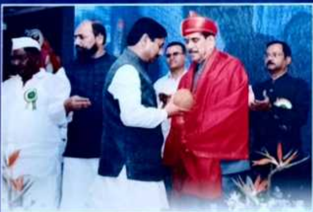
On Occasion Ex. Chief Minister Shri. Manoharraoji Joshi Sir