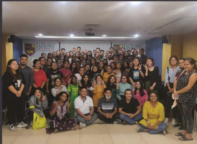
Workshop on "Dissection and Discussion on Gender Gaps in Modern India" organized by the School of Social Sciences