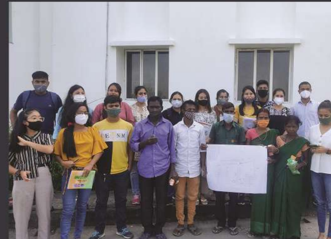
Workshop on "Community Led Development Planning" in collaboration with NEADS, Jorhat