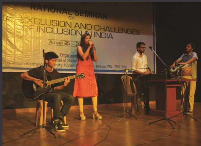
SSS Students performing at the National Seminar on "Social Exclusion and Challenges of Inclusion in India"