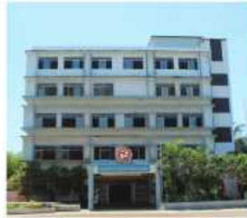
Dr. D. Y. Patil English Medium School (State Board)