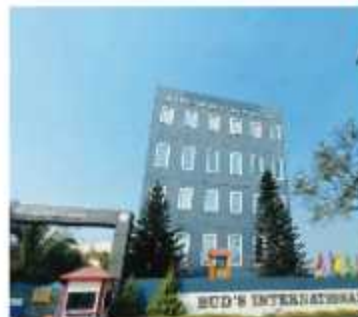
Dr. D. Y. Patil Bud's International School (CBSE)