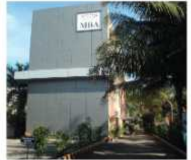
Dr. D. Y. Patil Centre for Management & Research (MBA)