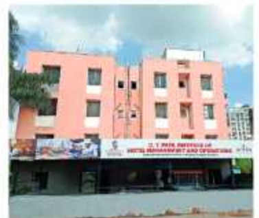
Dr. D. Y. Patil Institute of Hotel Management and Operation