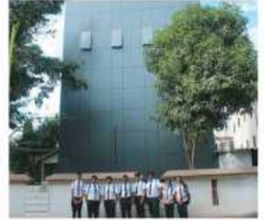
Dr. D.Y. Patil Jr. College of Arts, Commerce & Science