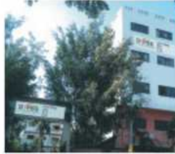
Dr. D. Y. Patil • Sr. College • B.A • BBA (CA) • D. Ed. • B. Com • B. Sc. (Comp.)