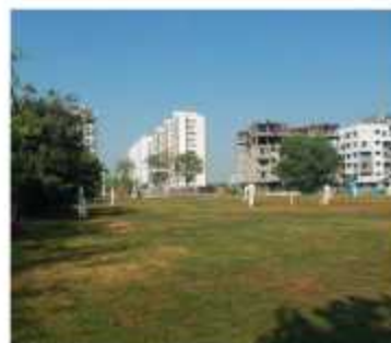
Dr. D. Y. Patil Sport Academy